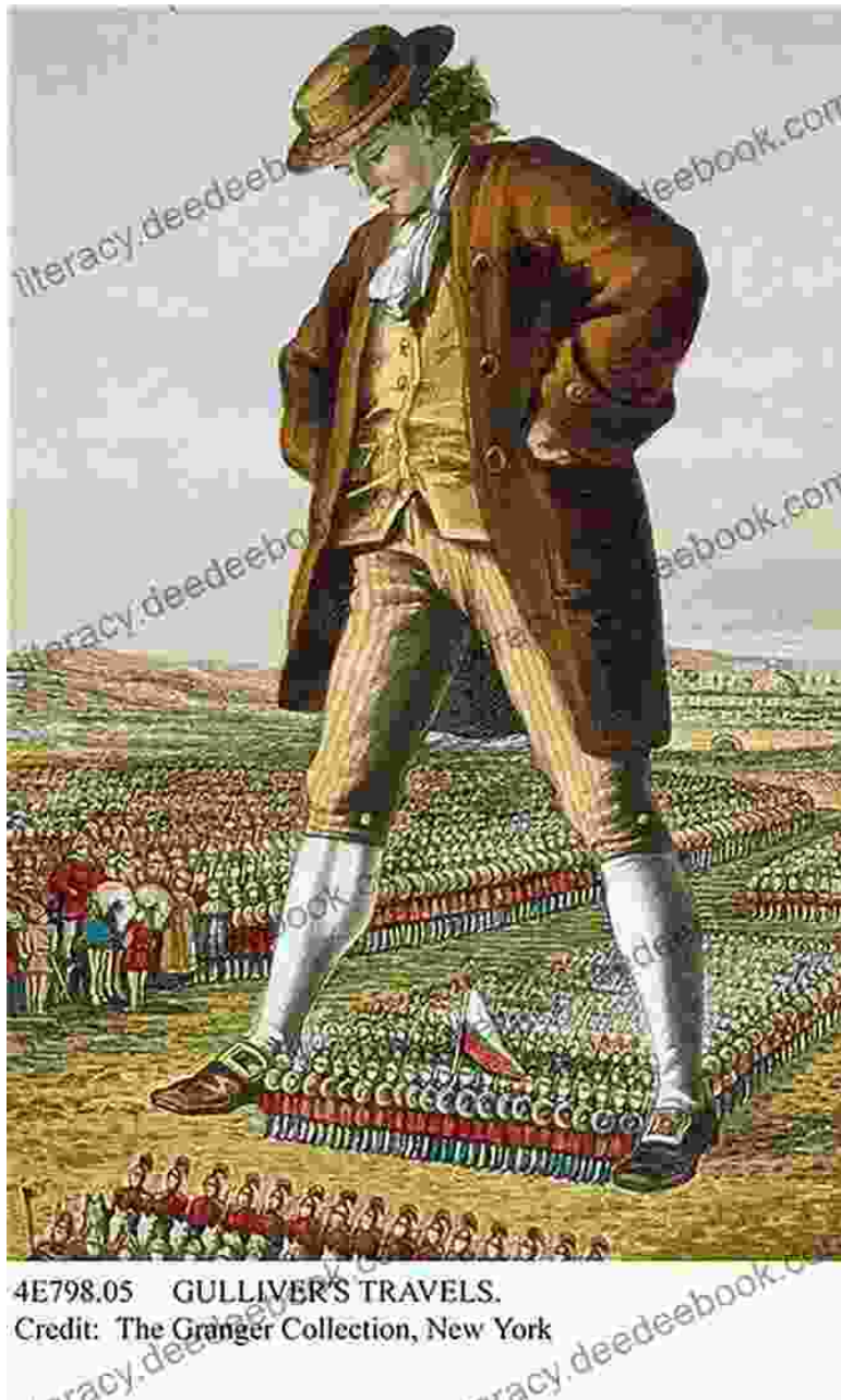
4E798.05 GULLIVER'S TRAVELS.

of Samuel Johnson's "Rasselas," where morality and the search for happiness are explored with profound depth.