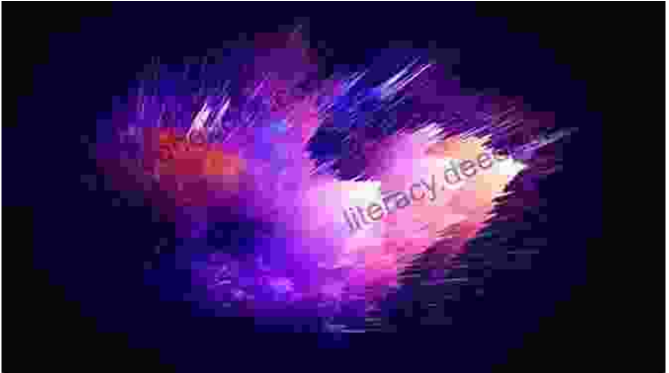
A modern website design with a dark background and vibrant imagery.