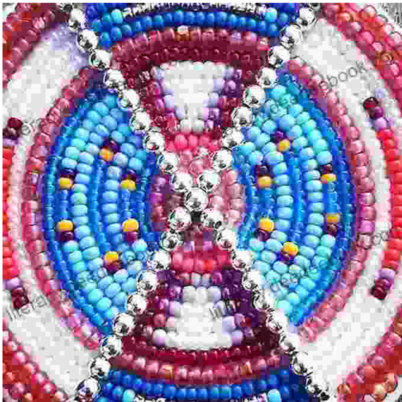
Intricate Indigenous beadwork design