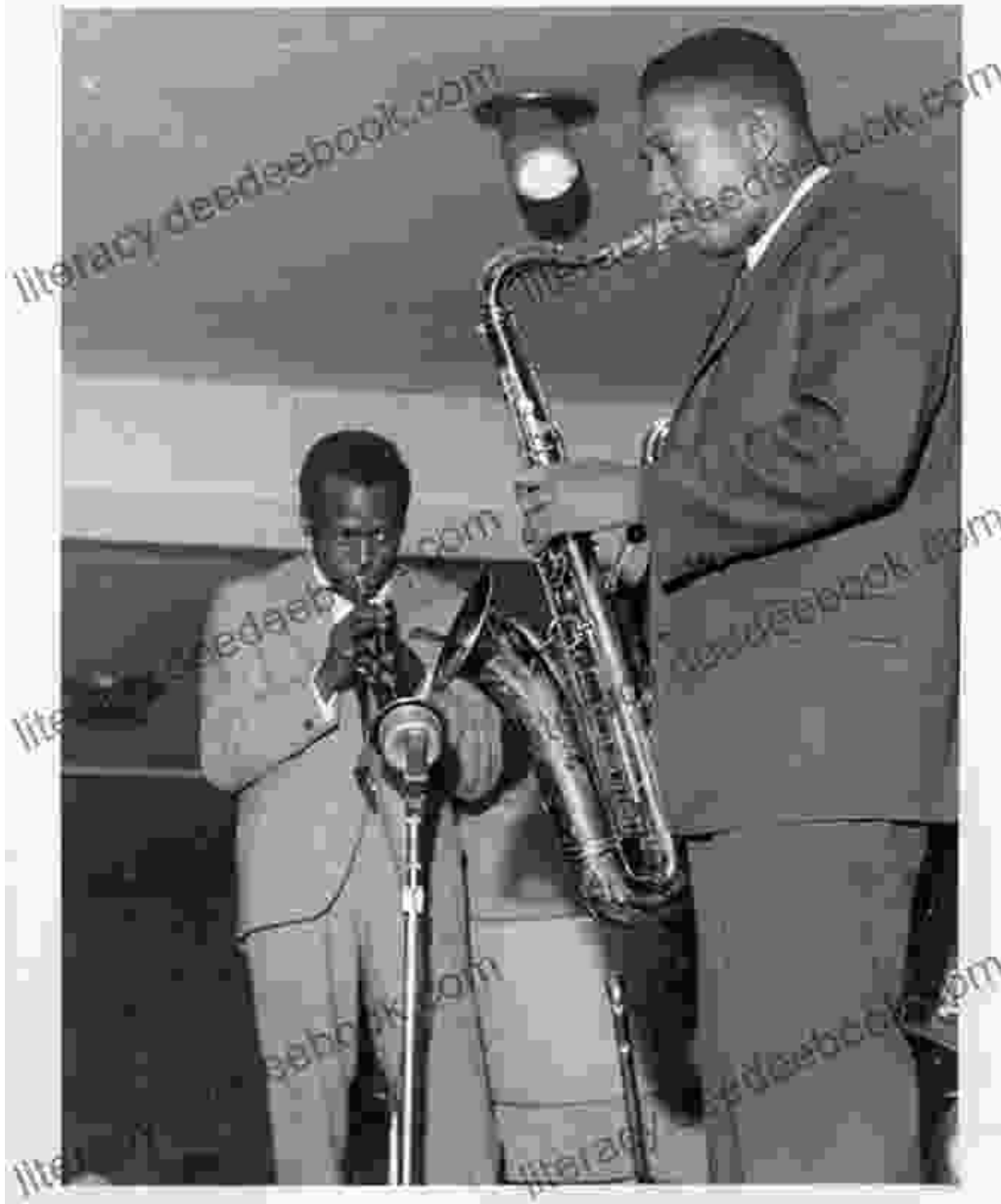
Miles Davis and John Coltrane, jazz masters who collaborated on classic albums