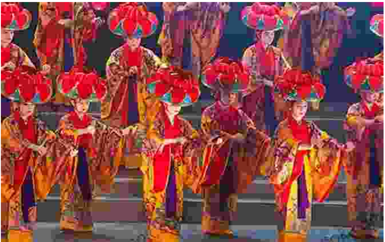
Okinawan dance performance in Taiwan

This interaction resulted in a blend of cultural influences that can still be seen in both regions today. For example, the Okinawan folk song "Asadoya Yunta" incorporates Taiwanese elements, while Taiwanese cuisine has been influenced by Okinawan cooking.