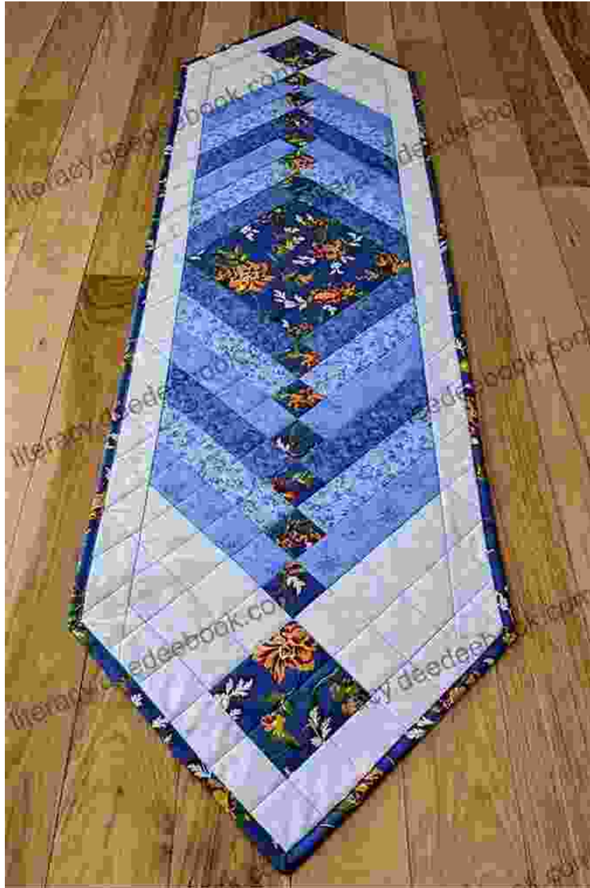
Table runners are a great way to add a touch of elegance to your dining table. They're also a great way to protect your table from spills and scratches. You can make them in any size or shape, and use any fabrics or designs that you like.